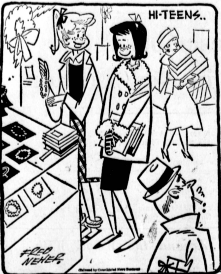
"I wear only silver jewelry... it goes better with my braces."