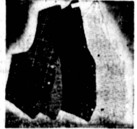
COPDUROY & WOOL COLORFUL VESTS - fashionably styled all-wool flannel or challis in handsome assortment of plaids, checks and solids...from 4.95