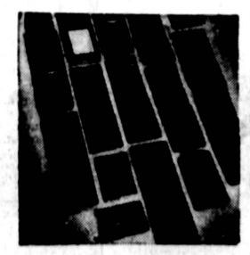
ACCESSORIES that combine beauty, utility. Handsomely craft-ed leather wallets, key cases and pocket secretaries . . . from 3.50