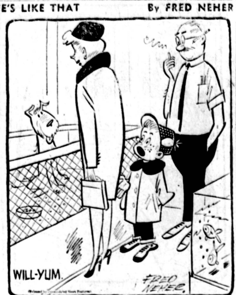
"How could be smell up the house, Mom? Dogs don't smoke!"