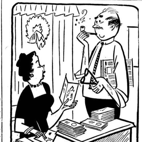
"Do you think the local Republican Club would mind if we sent a Christmas card to the Kennedys?"

Through another program, a person can make a gift to the "Y" and get a lifetime tax-