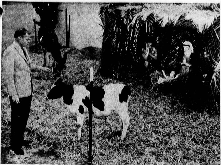
LIVING SCENE . . . Live animals again mark the life-size Nativity scene erected by the Stone and Myers Mortuary on its property on Torrance Boulevard between Cravens and Engracia avenues. Members of Torrance church choirs will present several programs of Christmas music at the site during the pre-Christmas celebration.