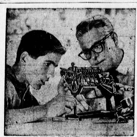
FATHER AND SON will both enjoy building one-quarter scale model engines. They help teach the mechanically minded youngster or adult model enthusiast the fundamentals of internal combustion and automobile engineering. All phasis of model building are rewarding, satisfying fun gifts for eager-to-learn youngsters.