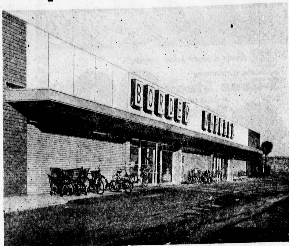
SECOND BETTER FOOD MARKET—Will cater to West Torrance and Redondo Beach families. Store is at 5305 Torrance Boulevard.