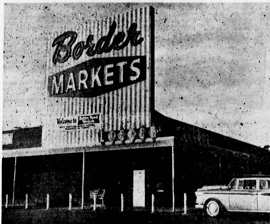
BETTER FOOD MARKETS—Takes over market at 643 E. 233rd Street at Avalon Blvd. in Carson area.