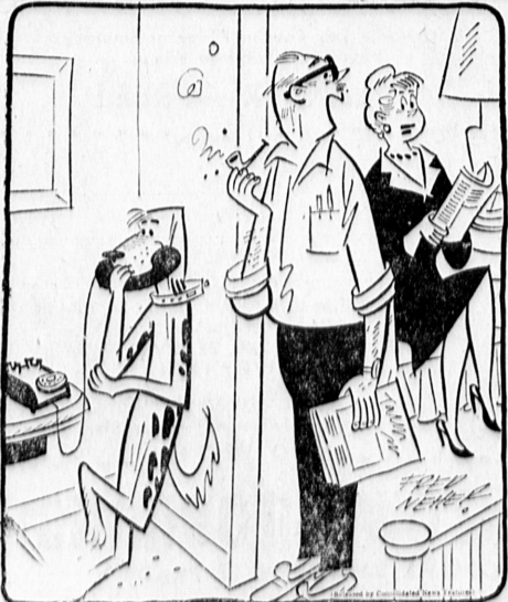
"It was for Spotty!"

Two performances—at 4 and at 7:30 p.m.—are scheduled on each of the Sunday dates. Free reserved tickets may be obtained by writing the Wayfarers' Chapel or telephoning FR 7-1650. Seating will be limited.