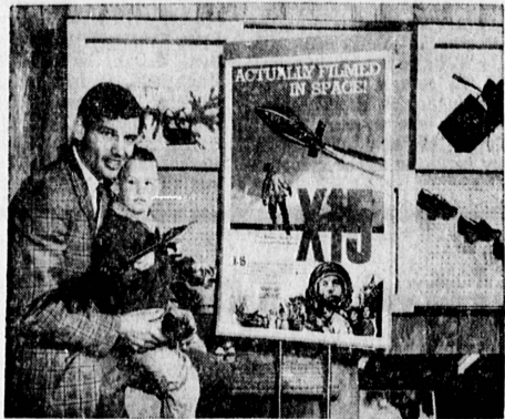
DEMONSTRATION... Ralph Taeger, co-star of the new motion picture "X-15," shows James McCloud the flight characteristics of the world famous rocket plane and the features of the X-15 line of boys' footwear now available exclusively at Sears, Roebuck and Co. retail stores.