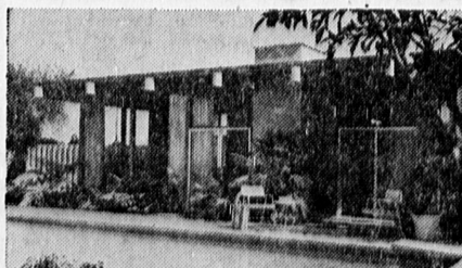
Exterior view of Encino Hills Model Home shows how effectively the architecture joins outdoors with indoors.

You're invited to visit Encino Hills soon. To see the "house with the outdoors built in." To see the smart new look in modern gas ranges. When you're ready to buy—a new range or a new home with a built-in kitchen—select a modern gas range with the finest automatic features.