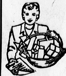
If You Are A Newcomer to Torrance Call