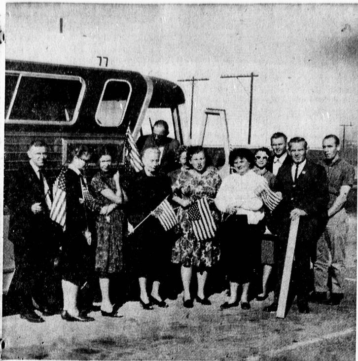
EXPRESS INDIGNATION.. Reversed flags set the mood as Torrance and Palos Verdes area residents board a bus to participate in an indignation rally in Los Angeles Tuesday. The group joined others in the Southland in protesting "aid in the form of money and military equipment to Tito and other communist block nations." Other protests are planned in Long Beach Thursday evening and in Hollywood Saturday evening.