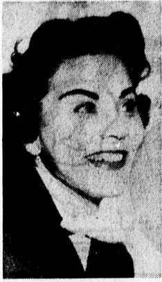
ANN LANDERS Enough for a Book