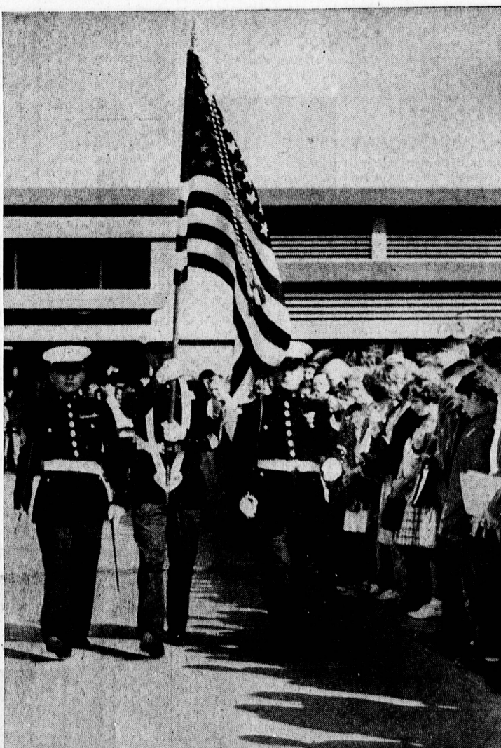
VETERANS HONORED.. Members of the Marine Corps form a color guard as the student body at South High School paid tribute to America's veterans in special ceremonies at the school Friday morning. The short ceremony was held on the mall of the campus.