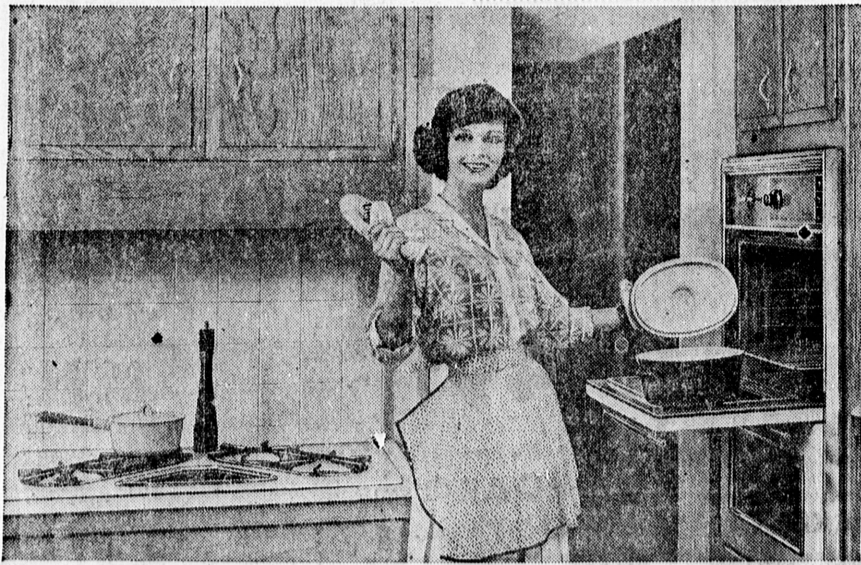
© 1961 S. CAL. G. & S. CO. G. G.

The big attraction at the County Fair was this charming "Home of the Year"! (of course...it features a modern gas range!)