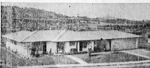
This Model Home at Sunset Hills is a duplicate of the Los Angeles County Fair "Home of the Year" which was selected for exhibit by the Building Contractors Association of California. Viewing hours are: weekdays 9:00 A.M. to 8:00 P.M.; weekends, 9:00 A.M. to 6:00 P.M.