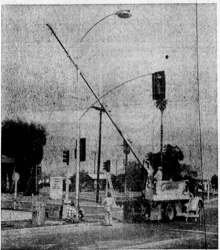
TRAFFIC SMOOTHERS... Crews install traffic control signals at Arlington and Jaz Del Amo, one of more than a dozen major Torrance intersections getting modern signal installations as the result of a City Council program adopted last summer. When completed, the program will eliminate the hazardous single unit, center signals which have been used for several years in the city.

ton and Newton, Mass. California facilities are now located in Monterey and Westchester. The building is being constructed by Haskell E. Shaw