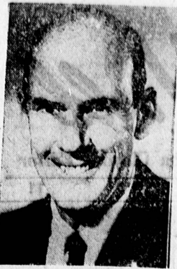
ALAN CRANSTON ... To Speak Here

Trio Odd Fellow lodge 495 will hold a breakfast at the Torrance Masonic Temple, 3226 Cabrillo Ave., on Oct. 29 from 7 a.m. until noon. Tickets may be purchased from any lodge member.