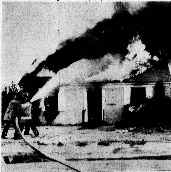
DOUBLE PURPOSE... Los Angeles city firemen practice their fire fighting techniques while at the same time clearing Park Department land in the 1300 block of Lomita Boulevard of homes. Three engine companies finished clearing the land of seven homes Friday. A playground in the area will be expanded after the land is cleared