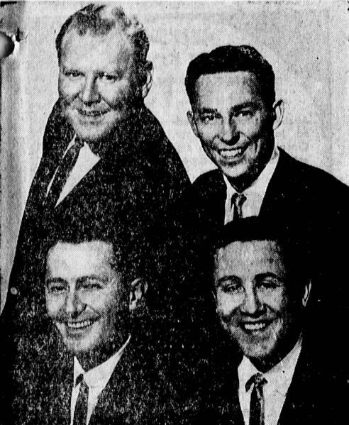
HERE FRIDAY... The Four Freshmen will appear at El Camino College Friday evening at 8:30 in a one-night performance. Tickets for the show, which has been scheduled in the Women's Gym on campus, are now available at the Campus Book Store.

"Can we come inside and finish our game, Mom? It's started to rain."