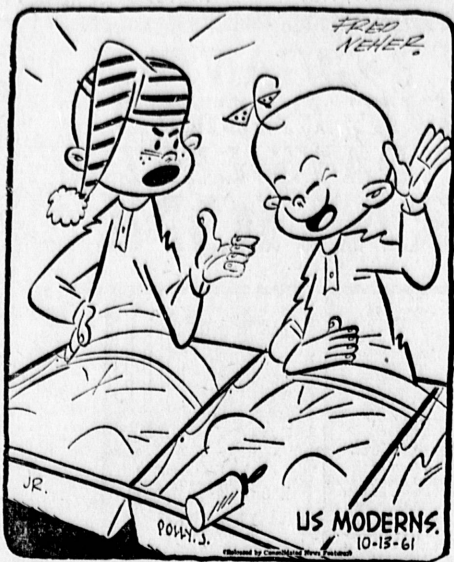
"How do you know Tab Hunter doesn't wear one?!"