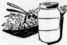
BIG 24-OZ. JAR