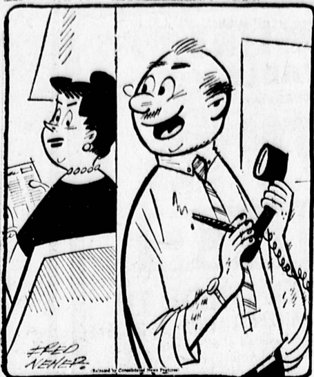
"The boys at the lodge want to know if you'd be interested in letting me win enough money to buy you a new hat?"