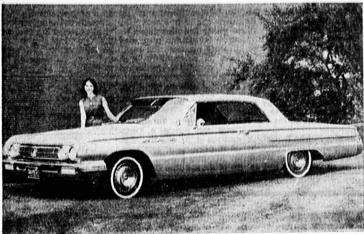
NEW BUICK MODEL . . . Appearing like a convertible, yet with a hard top is this new model Buick for 1962. The new line, now on display at Moench-Davis Buick's two giant locations at 8011 S. Vermont Ave. and 2025 W. Florence, features roomier interiors and a leveling of floor areas made possible by moving the engine forward on the chassis.