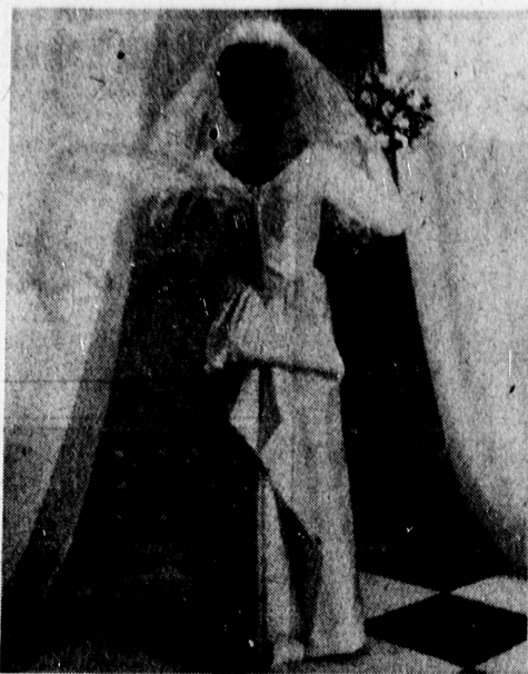
BRIDAL ELEGANCE... A feature of the Beautiful California Bridal show at the Broadway next Thursday afternoon will be this delustered satin sheath. It has floor length skirt, self fringed back panels and bodice appliqued with Alencon lace motifs.