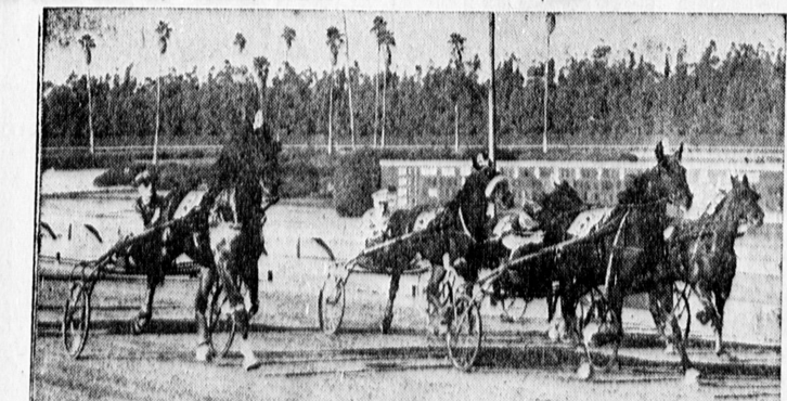
OFF AND RUNNING . . . Western Harness Racing begins its richest autumn season in the 16-year history of Hollywood Park; this coming week. The 35-day-long meet will be featured by the twin $75,000 American Classics.

THE AMERICAN Classics —both trotting and racing divisions—have ired some of the nation's top standardbreds including Su Mac Lad, undisputed king of the free-for-all trotters and winner of 14 of his 17 starts this season; Duke Rodney, champion of the $100,350 Yonkers Futurity; Spectator, who won the $51,927 Horseman Futurity and Silver Song, named trotter of the Hollywood Park meeting last fall.