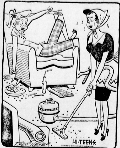
"Dotty's mother doesn't stay home all day like you do... she works."