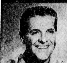
"Love That Bob" Starring BOB CUMMINGS

EVERY MORNING, MONDAY THROUGH FRIDAY, 11:30 a.m. CHANNEL 7