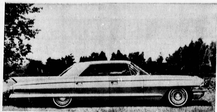
SEDAN de VILLE FOR '62 . . . Five 1962 Cadillac models feature this classic new roof design as shown here on the four-window Sedan de Ville. From the new front cornering light to the carefully fitted taillamp in the tail fin, the use of chrome is held to a minimum on the sculptured side metal. The 1962 Cadillac line will be shown by Ronald E. Moran Inc. tomorrow.

The heater will be standard equipment on all 1962 Cadillacs. Air conditioned cars will be quieter due to the use of a newly designed fan clutch and a smaller, lighter yet higher output six-cylinder Freon compressor.