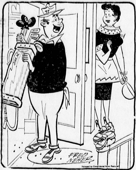
"I played with Doc Hardy today... the next six times we have our teeth cleaned will be free!"