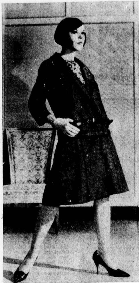
FASHION'S NEW FLUIDITY . . . Corduroy going around in new directions is featured in this emerald green wide-wale corduroy suit, worked on the horizontal in both jacket and shirt. This vivid, young look in fashion, will be shown in the May Co. South Bay Vogue Pattern show on Monday Sept. 25 at 2 p.m. and again at 7 p.m.