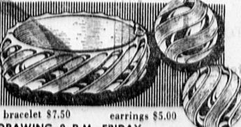
bracelet $7.50 earrings $5.00

PRIZE DRAWING 8 P.M. FRIDAY Come In And Register Now