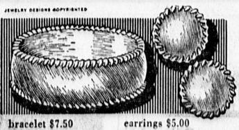
bracelet $7.50 earrings $5.00