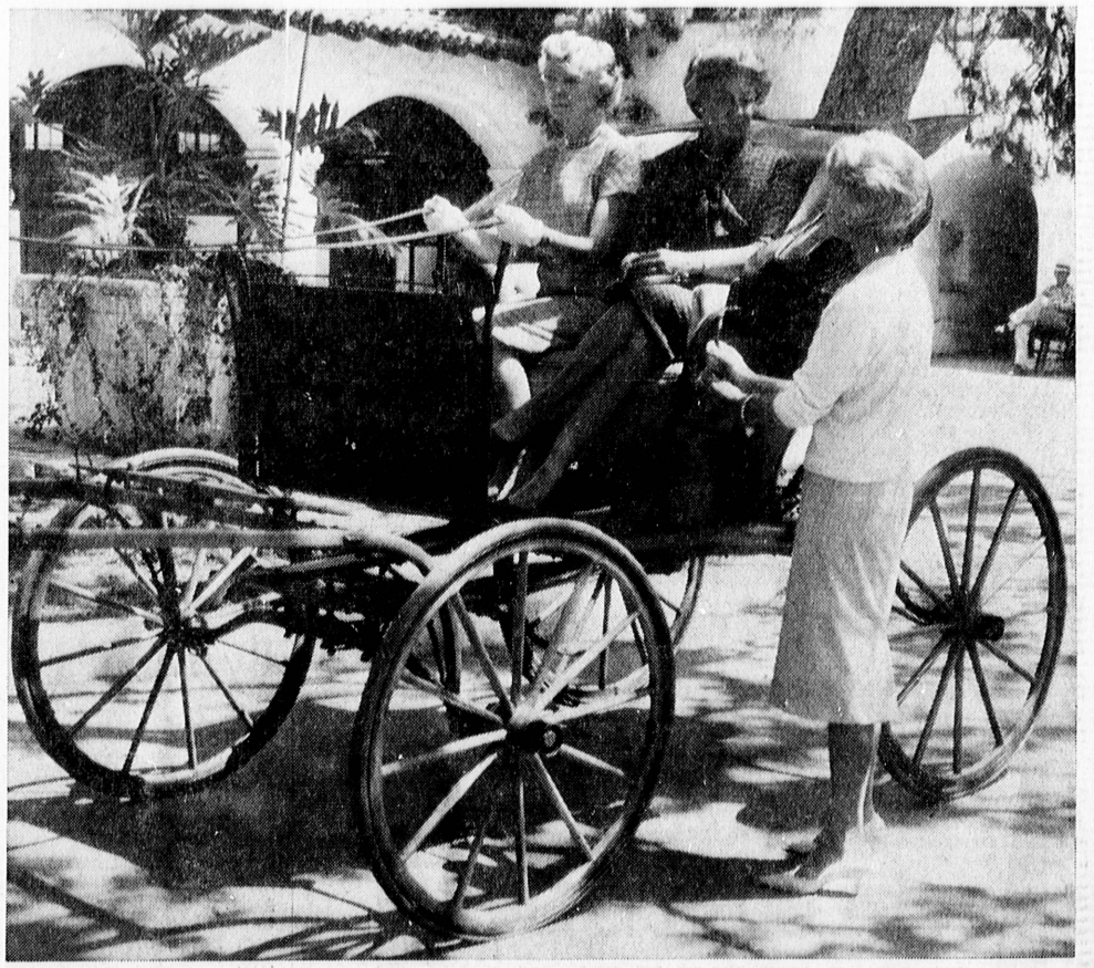
IT'S SHOW TIME . . . The Courtyard at the Portuguese Bend Riding Club, where many of the festivities for the annual Horse Show staged by the Palos Verdes Peninsula Committee for Children's Hospital, are held, is being