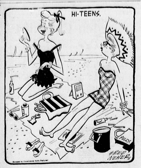
"Do I look dangerous? My mother says I'm at the dangerous age!"