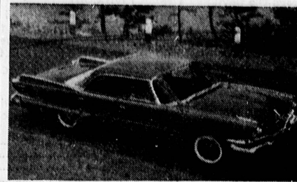
DODGE DARTS As Low As