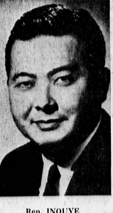
Rep. INOUE . . . Luau Speaker