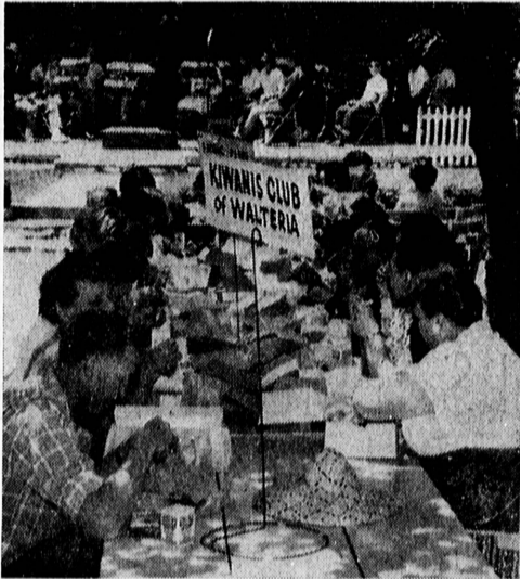
BE OUR GUESTS . . . Members of the WALTERIA Kiwanis and Lions Club share picnic lunch with pilots and co-pilots of A.W.T.A.R. Service and social clubs of area hosted guests at Torrance Park Thursday.