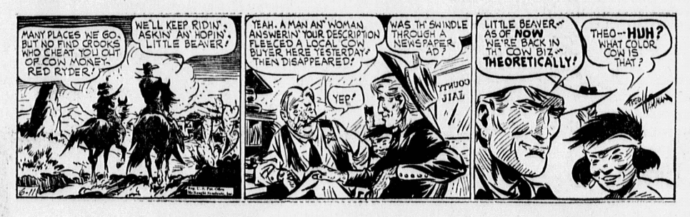
Follow Sunday's Herald Comics for Full Pleasure