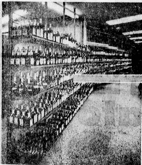
SELECTION. View of one wall of Magic Chef Liquor Department shows a sampling of the thousands of different items available for choice of Magic Chef customers. Magic Chef representatives comb nearly every country of the world to find the finest wines, beers, and liquors. Free-standing shelves shown here are an innovation in super markets, as is the washable gold damask wallpaper used to set off the tawny tones of the beverages on display.