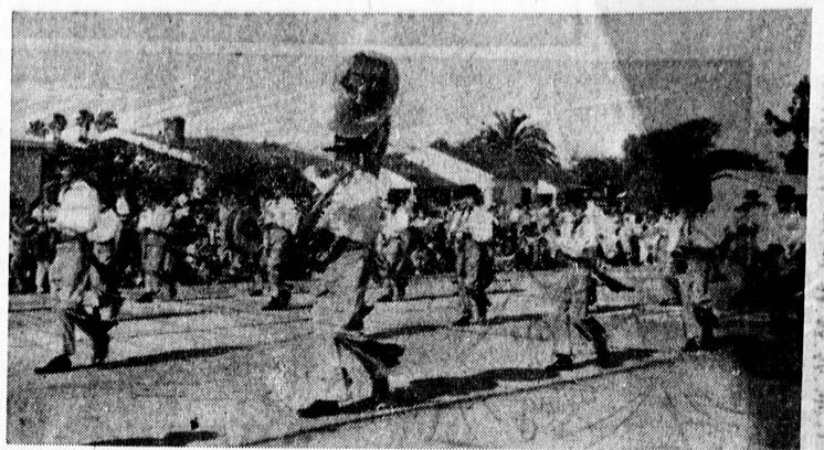
IN REPEAT WIN . . . Los C aballeros Youth Band wrapped up top honors at the annual Elks Rodeo-Parade in Santa Maria last Saturday. It was the third first in five starts this summer . . . the other two were seconds. The band is composed of young musicians from the Torrance, Wilmington, Gardena areas.

Countywide, measles continued to be the top disease reported with 487 cases, more than twice the 204 cases of mumps reported