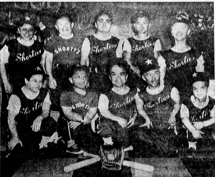
HOLLYWOOD SHORTIES . . . Movieland comic baseball team will play an exhibition at North Torrance Babe Ruth League field on Monday, Memorial Day, at 1:30. Tickets may be purchased from league managers and coaches and at the game Monday.

If it's Salmon you're after go to any of the rivers in northern Calif. The Rogue and mouth of the Klamath are the best spots. If you don't want to travel that far, Monterey is always good for salmon fishing, also the San Francisco Bay area. But, if you fish in the ocean, use three-to-four pound sinkers. It's clamming, go to Pismo Beach or any place below the border. There will be minus tides Monday thru Sunday of next week in the early morning.