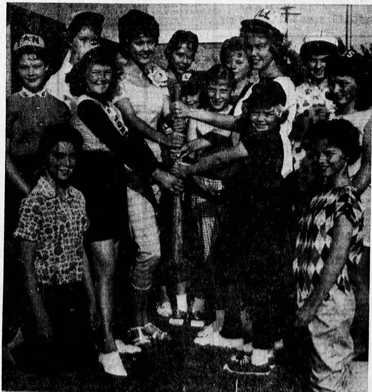
QUEEN HOPEFULS.. These 16 lovely Jassies will be vying for the titles of Miss Baseball and Miss Little League Saturday morning as a feature of the Torrance Baseball Parade Day. Each contestant is already a queen of one of the 16 volunteer youth baseball leagues in the city, which are participating in the first citywide parade.