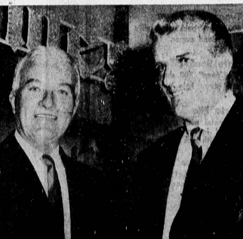
NEW PUBLISHER . . . Otis Chandler (right) is pictured with his father, Norman Chandler, at the April 11 luncheon in Los Angeles during which it was announced the younger Chandler will succeed his father as publisher of the Los Angeles Times. Otis Chandler, a member of the fourth generation in direct family descent, assumes charge of the Times in its 79th year. Norman Chandler will continue as president of the Times-Mirror Co.