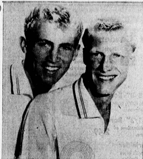
TO APPEAR HERE . . . Jan (left) and Dean, popular recording artists, will appear at the Thom McAn Family Shoe Center, 15900 Crenshaw Blvd., Thursday, April 28, at 4 p.m. in a contest to select two girls and a boy to be their guests for a "night on the town."