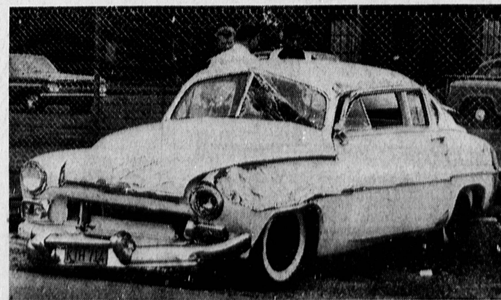
FENCE STRETCHER . . . A lengthy section of fence along Crenshaw Blvd. was badly damaged as was this auto Monday when it bounced out of control north of Del Amo Blvd. but the occupants of the car escaped with only minor injuries, Torrance police reports indicate.

Complete but unofficial tabulations showed yesterday that the card club supporters polled 4531 votes while the opponents polled 3721—a mere 810 votes. Previous endorsements of the clubs by Gardena voters has run as high as three-to-one.