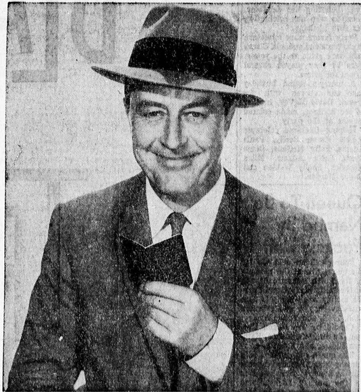
Ray Milland stars as "MARKHAM" on CBS-TV Thursday nights

HAWTHORNE AT SEPULVEDA DEL AMO SHOPPING CENTER