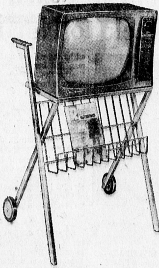
Major Appliances—Third Floor

Budget-priced model that is feature-packed. Full-width freezer holds up to 27 packages. Full-width chiller tray for short term freezing. Three full-width cabinet shelves. Two removable and adjustable door shelves. Two egg racks. Dial defrost convenience. Magnetic safety door.