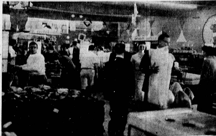
EARLY SHOPPERS . . . Shoppers came to look and stayed to buy as Torrance's newest store, The Akron, opened its doors Tuesday morning. Special merchandise gathered from the far points of the world by Akron buyers had strong appeal to local shoppers who roamed through the huge store with shopping baskets, filling them as they went.

Burial will be in Roosevelt Memorial Park.