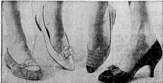
TWIXT 12 AND 20 . . . These are the leather shoes the gals will be choosing. From the left, brushed leather with moc toe, strap and brass door knocker trim; smooth leather in pastel with white bow; gay colored reversed leather with black patent leather; mid-heel patent pump trimmed with bow in brass frame. All delightful.