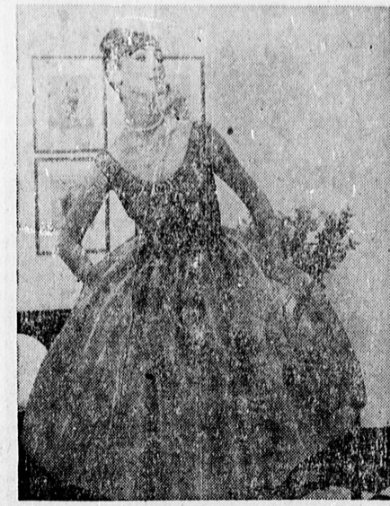
FOR GALA OCCASIONS . Strehli's pure silk organza cut with whispering allure and a suggestion of intrigue. Radiating in minute tucks from a delicate rose the dress flows to a piped waistline and a graceful bouffant skirt.