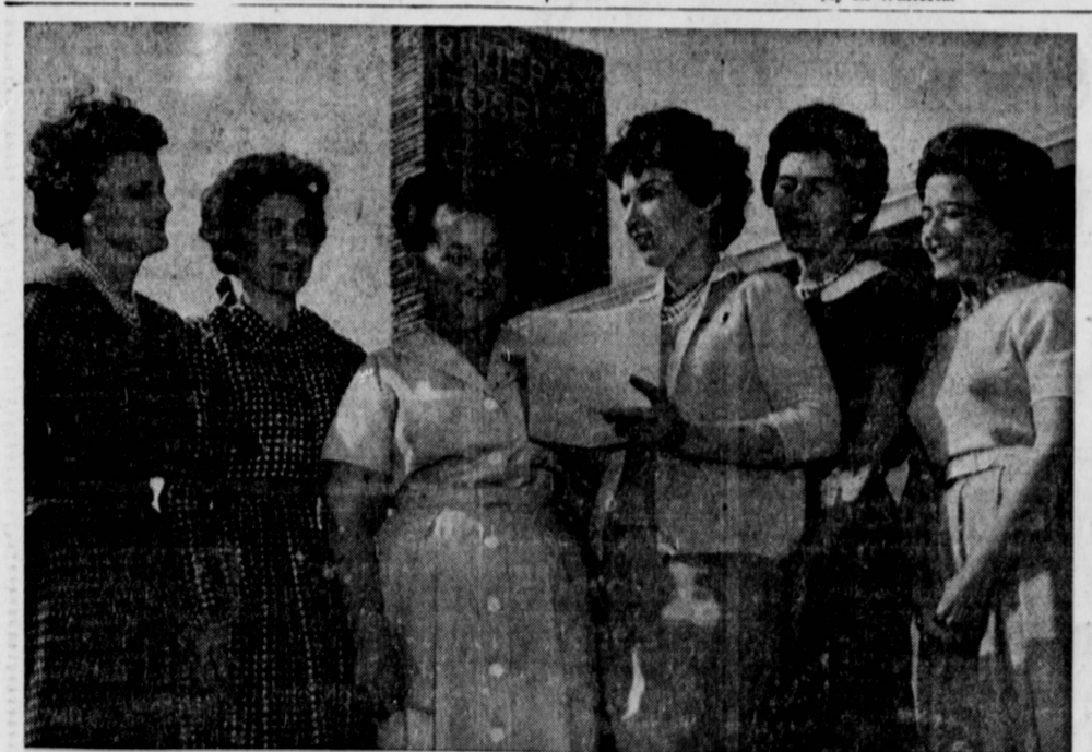
OFFICERS OF NEW AUXILIARY . . . . Wives of doctors who recently purchased the Riviera Community hospital, 4025 W. 226th St., to be operated as a non-profit organization, have formed an auxiliary to assist with the up-keep of the four-year-old hospital. Shown here with