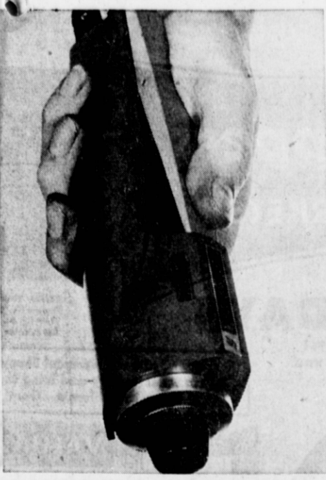
EXPLOSIVE TESTER . . A small, hand-held impulse tance bridge, designed by Fleming Industries, Inc., orrance, is said to be the first of its kind—one of a family of unique, portable instruments for safe testing of explosives and other heat sensitive devices it is designed to test propelled or cartridge-actuated devices in missile launch, separation, or destruct packages by measuring circuit resistance.