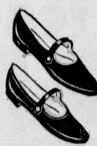
YOUNG MISSES' PATENT PUMPS 4.97, 5.97

Buttery-soft leather flats with buckle or bow trims; some with needle-toe. Black or bone. Available in sizes 5 to 9.