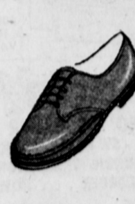
BOYS' STURDY Z-WELT OXFORDS 4.97, 5.97

Button 'n strap style black patent pumps with new taper-toe styling. Sizes 9 1/2 to 12, 4.97. Sizes 12 1/2 to 3, 5.97.