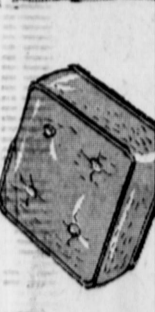
MFG'S CLOSEOUT TOSS PILLOWS 57c

Newest toy sensation as seen on TV; colorful, flexible polyethylene stix with notched ends to build anything imaginable.