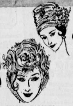
"EASTER PARADE" BETTER MILLINERY 1.67, 2.27

Excellent assortment of spring-to-summer bags in many sizes and shapes. Black patent, navy, bone, white *plus 10% fed. tax.