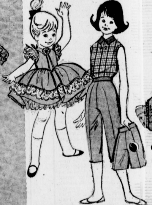
RUFFLES 'N RIBBON EASTER FASHION 4.87

Right, feminine blouse with large platter collar trimmed with flower-sprig applique and deep heavy lace. Shown with tapered capri, fully lined with high-rise waist and wide self-belt.