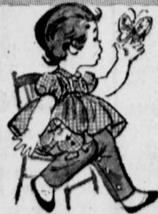
INFANTS' GAY CRAWLER SETS 2.47

Moc-stitched oxford in supple black leather with sturdy Goodyear welt. 8 1/2-12, 4.97; 12 1/2-3, 5.97. Also 3 1/2-6, 6.47.