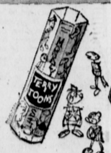
TV IDEAL'S MONKEY STIX 59c, 1.19

Boys' and girls' 100% cotton wash 'n wear sets in butcher style, applique on knee. Beautiful assortment of pastel styles; S, M, L.