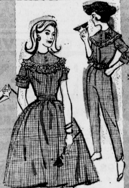
CHECK COORDINATES 2.47 blouse

Left, boxy topper with double breasted styling featuring six shiny golden buttons, shawl collar, taffeta lining; 8 to 16. Right, long topper with knit insert trimming the collar; measures 30 inches long; 8-18. Both of 80% orlon, 20% wool laminated jersey knit in beige, red, black.