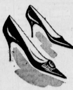
BEAUTIFUL FASHION PUMPS 9.47

Simple styling delicately underplays the ornate, lustrous fabric in this two piece ensemble. Sheath dress has scoop neck, tiny cap sleeves and flat bow at midriff with a pencil slim skirt. Matching three-quarter duster has wide, wide wing collar and is fully lined. Choose blue, beige or lilac in regular sizes 12 to 20 and also in sizes 14 1/2 to 22 1/2 for the fuller figure.