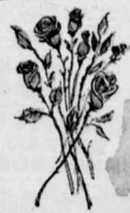
EXQUISITE LIFE-LIKE ROSES 76c dozen

29.75 values Fully jeweled movement, expansion bands, dressy and sport styles in white or yellow gold; has full one-year guarantee.