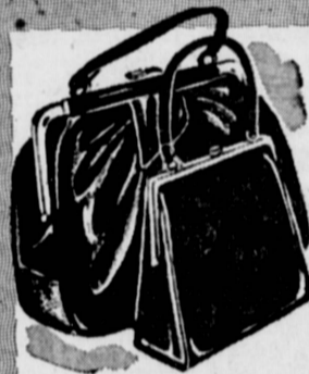
SHINY PLASTIC PATENT HANDBAG 2.74*

Excellent assortment of spring-to-summer bags in many sizes and shapes. Black patent, navy, bone, white *plus 10% fed. tax.