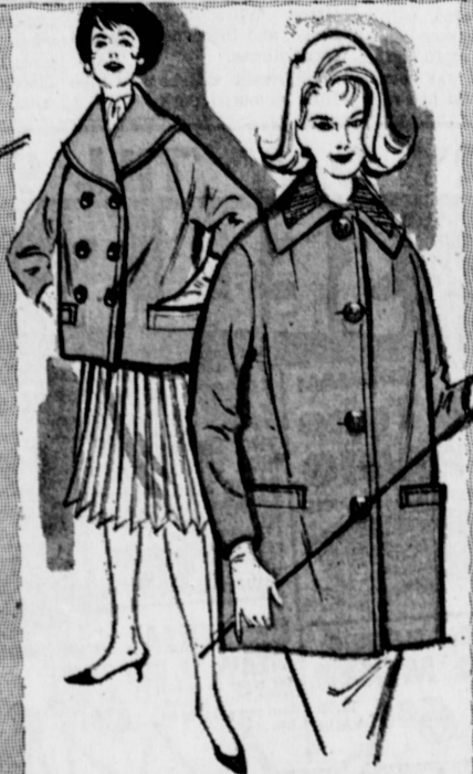
VERSATILE SPRING TOPPER IN JERSEY KNIT 10.77

Left, boxy topper with double breasted styling featuring six shiny golden buttons, shawl collar, taffeta lining; 8 to 16. Right, long topper with knit insert trimming the collar; measures 30 inches long; 8-18. Both of 80% orlon, 20% wool laminated jersey knit in beige, red, black.