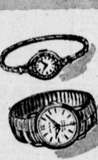
MEN'S & WOMEN'S FINE WATCHES 14.94*

Elegant flowers and interesting textured straws in white, dion blue, pink, mint, lilac, daffodil and vibrant orange.