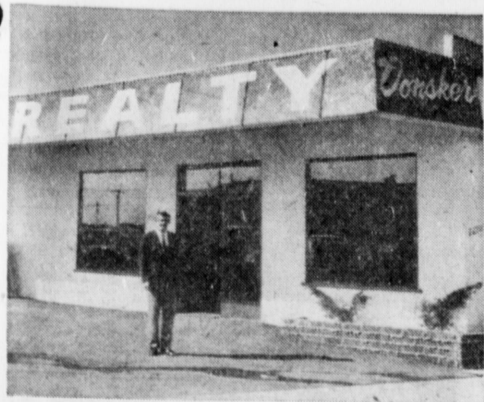
NEW QUARTERS . . . Marvin Donsker stands in front of newly opened branch office of the realty firm, located at 2220 Sepulveda Blvd. Pete Petersen will manage the Torrance office with residential, income and land sales a specialty. Donsker Realty is also located at 4333 Redondo Beach Blvd.