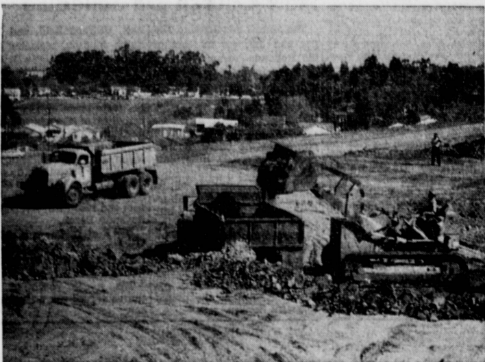
FILL SOURCE . . . Skip-loader is shown filling dump truck at excavation south of Pacific Coast Hwy. at Crenshaw Blvd. This is one of five areas where dirt for San Diego Freeway is being obtained. Truck will join chain of others and head north while next vehicle gets load.